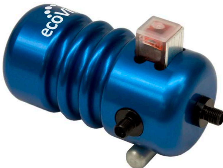
ecoVis Light Source

EcoVis is designed for absorbance and fluorescence of cuvette-based samples. Its rugged housing and simple design make it useful for teaching labs and setups where basic absorbance and fluorescence measurements are performed routinely.