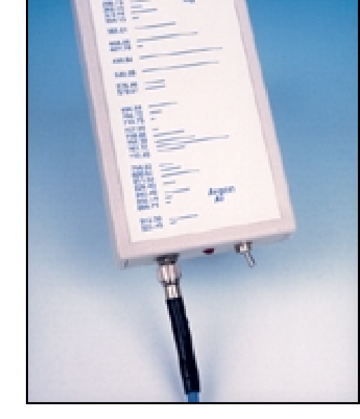
HG-1 Mercury Argon Calibration Light Source